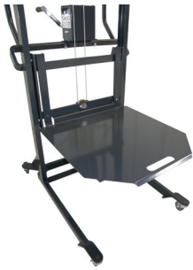
Movable platform Ref: 300196