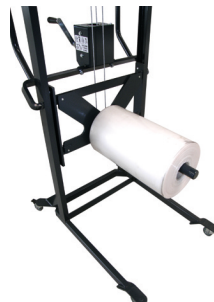
Single arm Ref: 300203