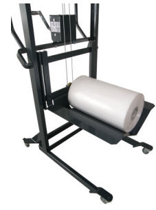
Longitudinal V-Bed Ref: 300201