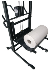
Transversal V-Bed Ref: 300197