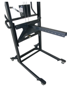
Crane arm Ref: 300204