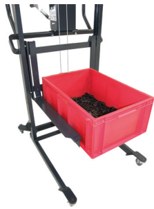
Europe tray holder Ref: 300202