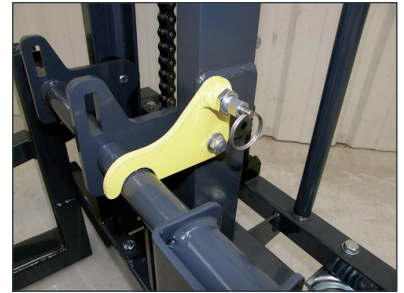
Ram blocking device, to secure during transportation in vehicle.