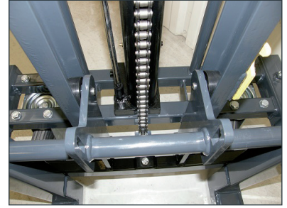
Strong ram, guided by 4 encapsulated balls bearing