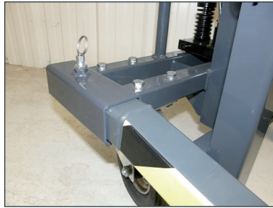
Stingers easy to remove, to facilitate storage.