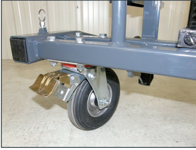
Rubber tyres \varnothing 200 mm, with 2 castor wheels with brakes