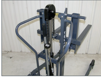
Manual hydraulic lifting device, reliable and easy to use.