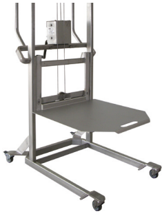
Movable platform Ref : 900132