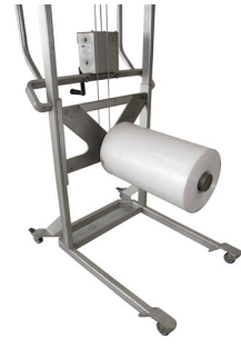
Single arm Ref sur demande