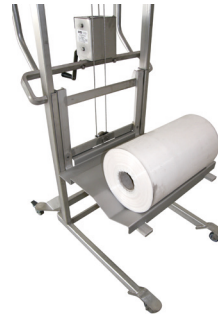
Transversal V-Bed Ref : 900135