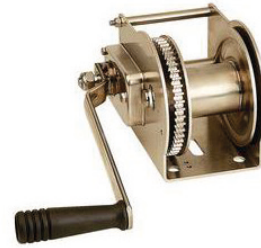
Stainless steel winch Ref : 350037