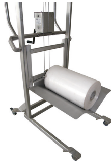
Longitudinal V-Bed Ref : 900134