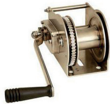
316 L stainless steel winch Ref: 350 037