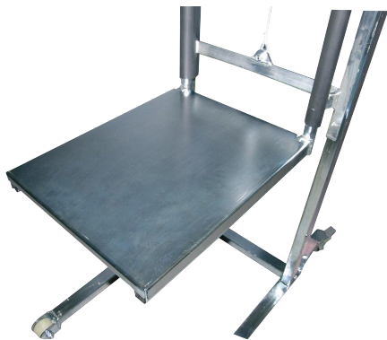
Platform Ref: 300 737