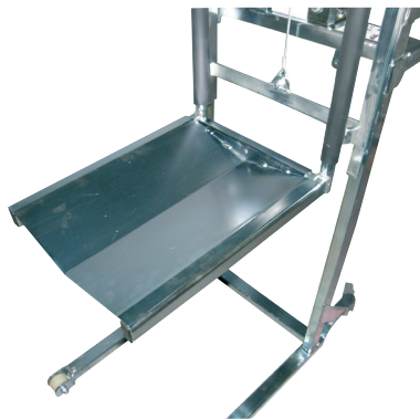
V-Bed platform Réf: 300 738