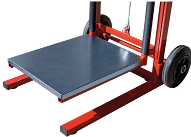
Platform 450 x 350 mm (LxW) Ref: 300 188