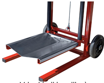
V-bed (roll handling) Ref: 300 189