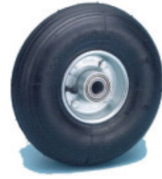
Inflatable wheels kit ø200 Ref: 220 486